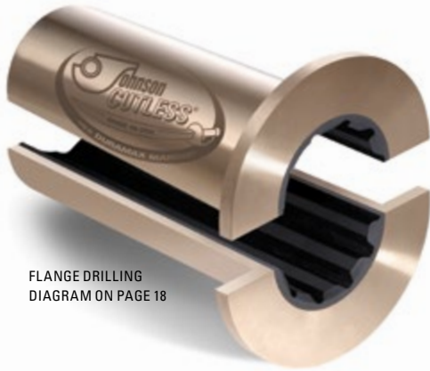
FLANGE DRILLING DIAGRAM ON PAGE 18

Johnson Cutless® Flanged Bearings are centrifugally cast naval brass with an integral flange for bolting to stern tube or strut housing to retain bearing and prevent rotation in housing. Specially formulated oil and chemical resistant nitrile rubber is securely bonded to the shell.