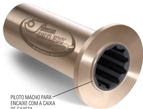
PILOTO MACHO PARA ENCAIXE COM A CAIXA DE GAXETA

Os rolamentos flangeados para tubo de popa anterior Johnson Cutless® são de latão naval centrifugamente moldado e dispõem de uma camada de metal pesada e um flange integral. O composto de borracha nitrílica especialmente formulada está seguramente ligado ao revestimento de metal e é resistente a produtos químicos e óleo. O flange integral permite a sólida fixação por parafusos do rolamento à caixa de gaxeta do tubo de popa. O piloto macho no flange integral coincide com o encaixe fêmea da caixa de gaxeta. Os flanges são fornecidos SEM FUROS a menos que especificado diferentemente. Consulte a página 18 para "Diagramas de perfuração". Para estilos divididos ou escalonados, consulte as páginas 14-17.